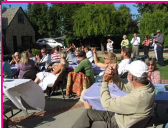
Awards Ceremony 2008