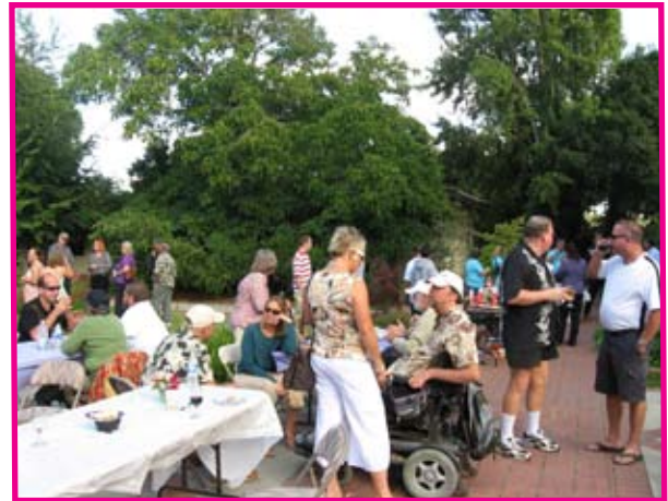
Awards Ceremony 2008