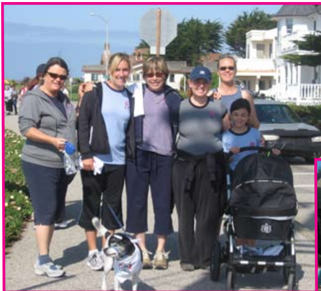
Human Race 2007