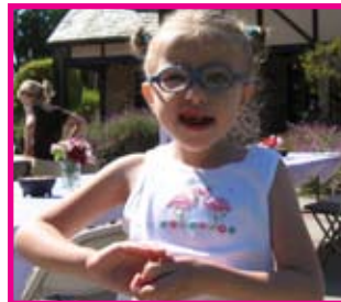
The First Community Spinner Awards August 23, 2008