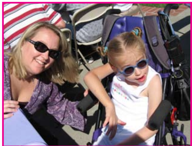
The First Community Spinner Awards August 23, 2008

para lo último en actividades, talleres, grupos de apoyo, y más!